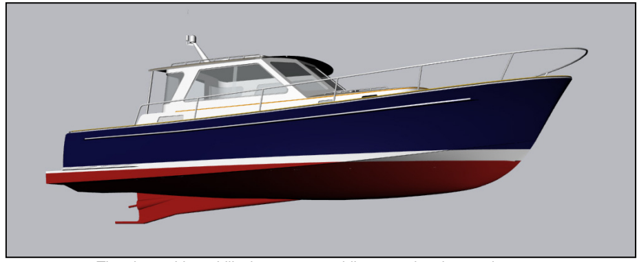
The skeg adds stability in a seaway while protecting the running gear

ride in rough seas, and exhibits great performance and seakeeping in the high cruising speed range.